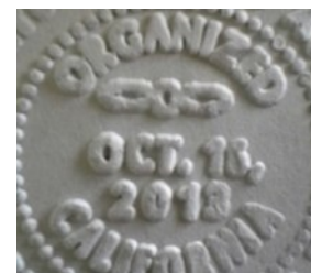
Picture 3. CCCA Seal of Incorporation.

The CCCA Executive Board will address any legal issues and submit the final package to the full Board of Directors for final approval. Once accomplished the Executive Board will post to the new Bylaws to our website and make a general announcement to the membership.