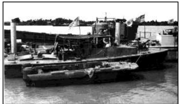
Side view of the LCPL MSSC next to a 23 foot Power Cat SEAL Team Attack Boat of MST 2 Det Bravo Binh Thuy. Note the long pilot house with angular front, gun tub with mini-gun, different stern armament suite with two side mounted .50 cal HMGs and a twin M-60 7.62 mount covered in this picture as well as longer rear deck. The PL also had a single engine and propeller as well as a longer awning and mast arrangement.

Though the SEALs from Team 1 had been in country since 1962 and Boat Support Unit 1's (BSU-1), Mobile Support Team 1 (MST-1) had been operating since 1964 from Da Nang, the SEALs soon found even with an outboard motor, the IBS was just too slow, small and exposed for the tides and currents of the Delta, while the Boston Whaler was faster but too small and exposed and neither could provide suppressive fire with crew served weapons, and the mighty PTFs were just too big for the narrow rivers and canals. Additionally, though PBR's from Task Force 116 Game Warden's provided a better platform with much more speed and firepower, they were not always able to break away from their assigned river patrol commitments to support SEAL missions. Surprisingly, Boat Support Unit 1 (BSU-1) at NAB Coronado had not only tested the PBR, but they also developed initial training for the craft. To rectify this lack of organic boat support, the SEAL Team 1 men got a hold of an LCPL (36 foot Landing Craft Personnel Large) and an LCM (Landing Craft Medium) then they transformed them into SEAL support craft adding .50cal machineguns, other heavy weapons and armor. However, the next issue was manpower. Half of the platoon was manning the boats, while the other half was going ashore for operations. Furthermore, maintenance was a significant problem, while they could bor-