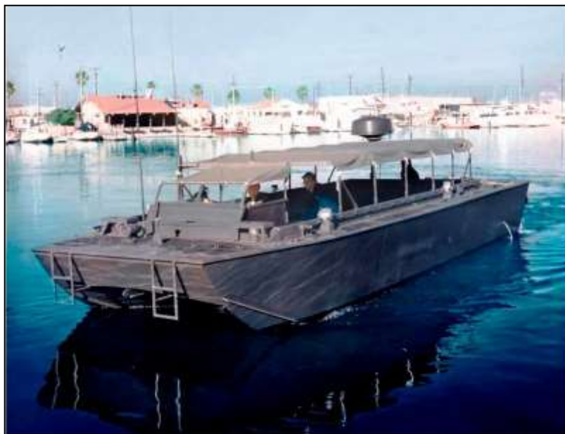
A brand new production Atlantic Research MSSC. The small ladders on the front would soon be replaced by a cargo net and she would be heavily armed.