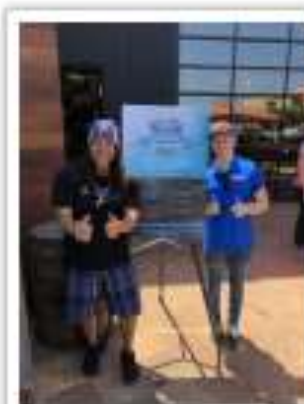
Alzheimer's fundraising event in Mira Mesa

We couldn't do what we do without the cherished support of our collaborative partners. Thank you, San Diego Veterans Museum, for the use of your facilities!