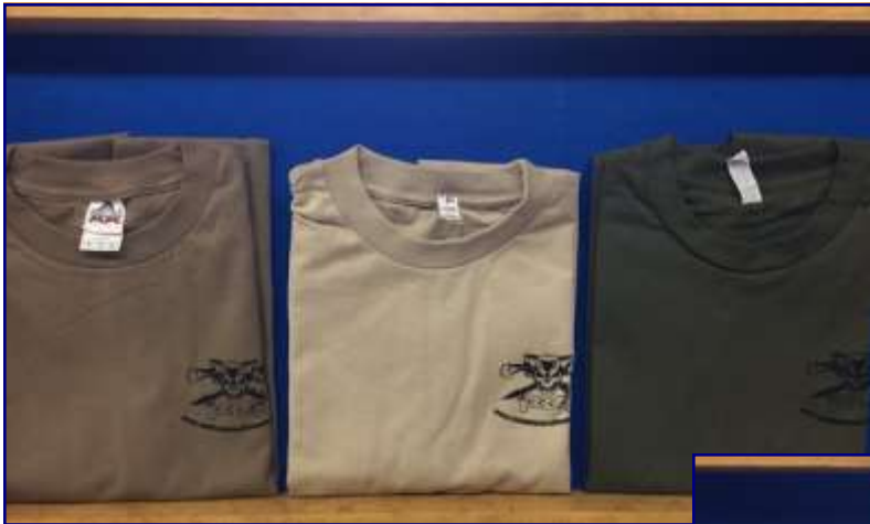
CCCA Veterans Appreciation T-Shirts: $15.00