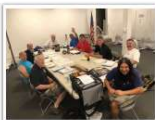
CCCA Board Members hard at work planning future activities but taking time to capture the moment!