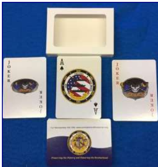
Cards are 11.99 each or 2 for 19.64 (The year it all began)