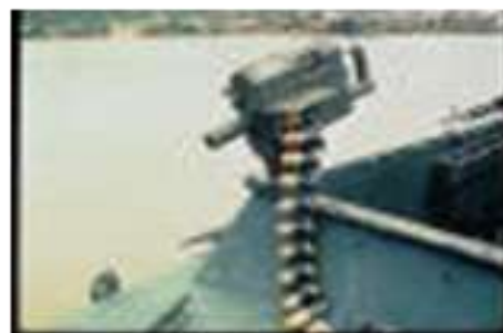
A good close-up of a Mk 18 mounted on the forward, starboard weapons mount of MST-2 Detachment ALPHA's Light SEAL Support Craft or LSSC just after its return from an operation. The fabric belt was a fiberglass tape construction that resisted the climatic conditions in Southeast Asia.

Use was simplicity itself: the safety was set to OFF and the hand-crank was turned. The star wheels drew the rounds into the firing position -- centered between the upper and lower star wheels -- then fired -- and then passed out the ejection port by the rotating star wheels. The 40mm grenades were not withdrawn from the belt like other machine guns; the fired cases remained in the belt.