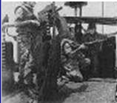
Mk 18 Mod 0 40mm grenade launcher ready for action aboard a PBR during the Vietnam War. Note the large ammunition box on the left, that gun feeds from left to right, and the expended cases remain in the belt after firing. The kneeling sailor has an M79 single-shot 40mm grenade launcher.

The first attempt to build a fast-firing alternative to the single-shot M79 was the Honeywell Mk 18 Mod 0 multiple grenade launcher. The Mk 18 fired the same round as the M79 launcher, the 40x46mmSR, and not the more powerful 40x53mmSR round used by the later Mk 19 Mod 0. The Mk 18 used a split breech system and was manually operated by a hand-crank. The split breech was actually two pairs of four-lobed star wheels. The tab of its fiberglass-reinforced belt of 24 rounds was introduced into the feedway and pushed through while the hand-crank was turned to index the first round. Once indexed, the gun was set on SAFE until needed.