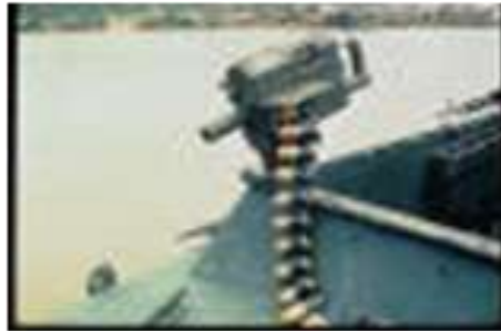
MK-18 Page 4